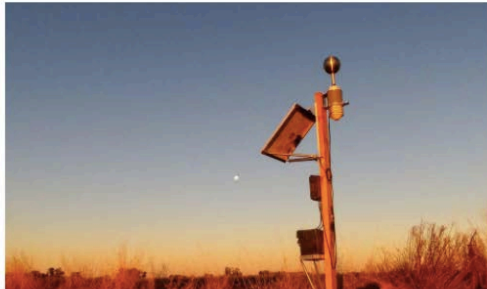
RTi weather sensor in Argentina · UNDERSTORY