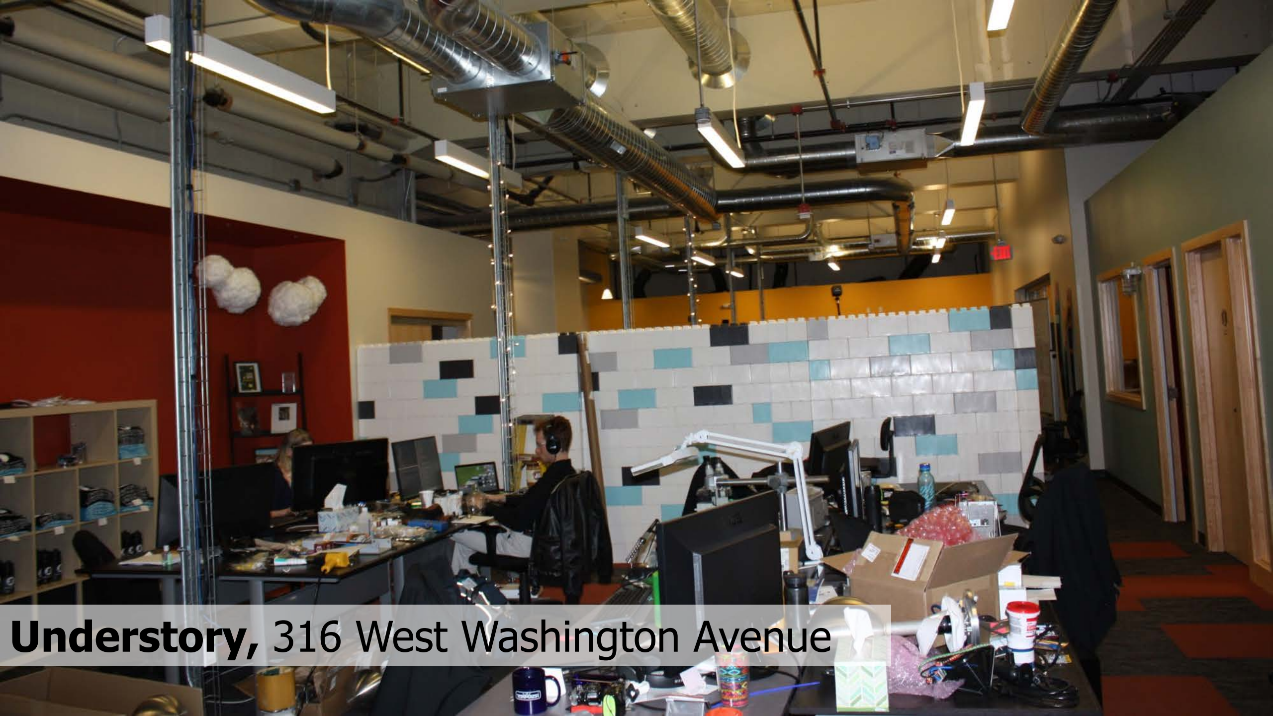
Understory, 316 West Washington Avenue