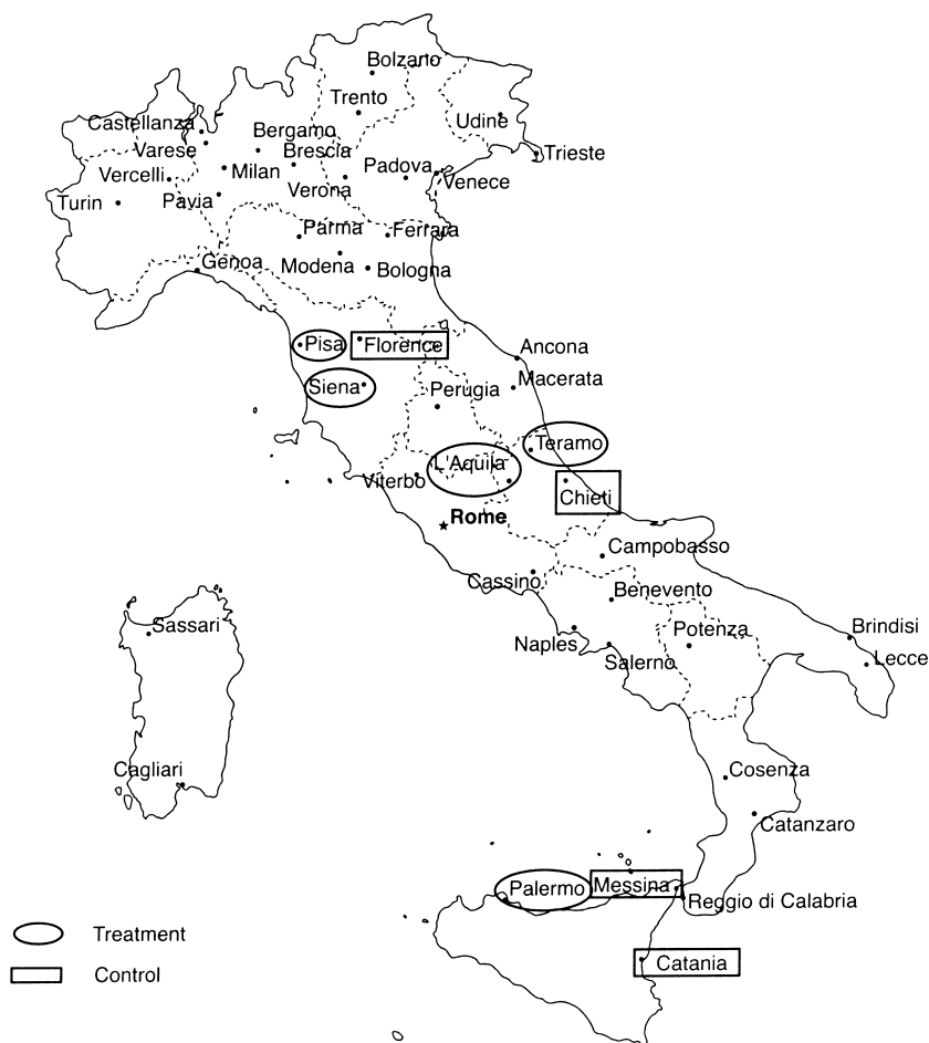
Fig. 4.2 Regions with both AlmaLaurea and non- AlmaLaurea universities

Note: Map displays only those cities that have a university.